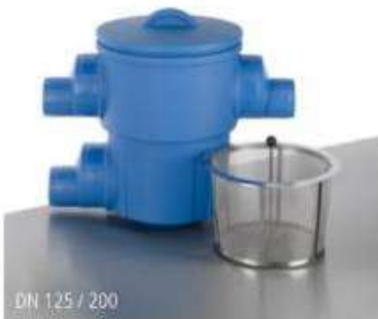
DN 125 / 200